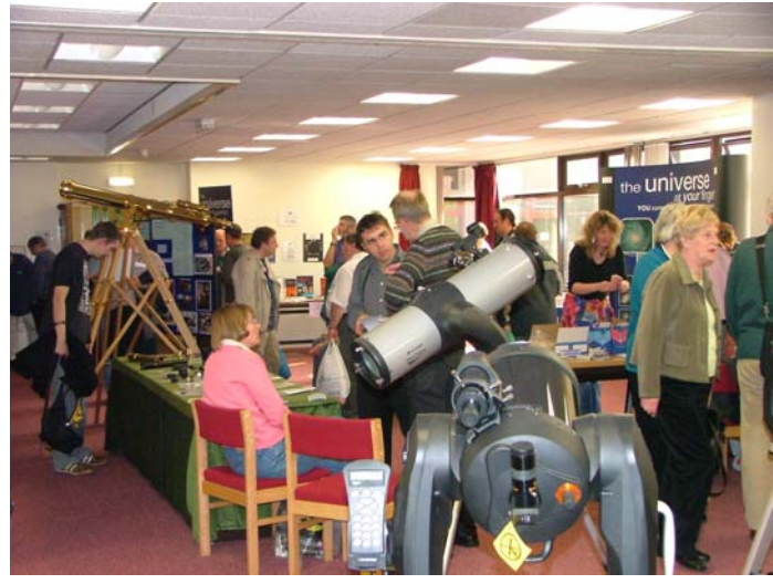
The Trade Stand Area at the Cardiff AS 30th Year event

Many thanks to the Department of Physics and Astronomy, Cardiff University for their support, to check out future events please visit <u>http://www.cardiff-astronomical-society.org</u>