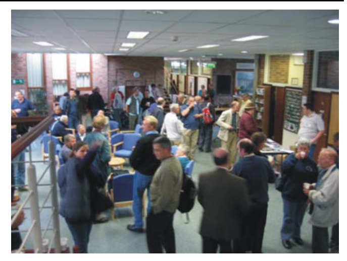
Tea time with 'biccies' in between lectures

Lunch consisted of a hurried chocolate biscuit and a cup of coffee. There