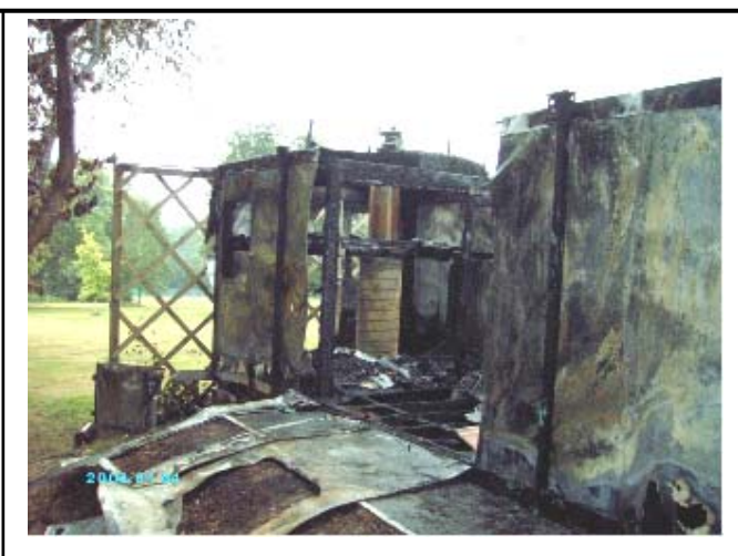
The remains of the observatory of the Birmingham AS - as reported in Issue 79

Bulletins which actually started out life as part of Bridgend AS newsletter. It just goes to show what a closely knit bunch we amateur astronomers are!