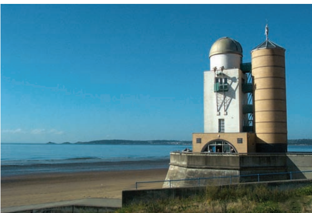
Marina Towers Observatory

For further information call our Public Relations Officer on 01792 299311 or annandbrian@abspink.freeserve.co.uk