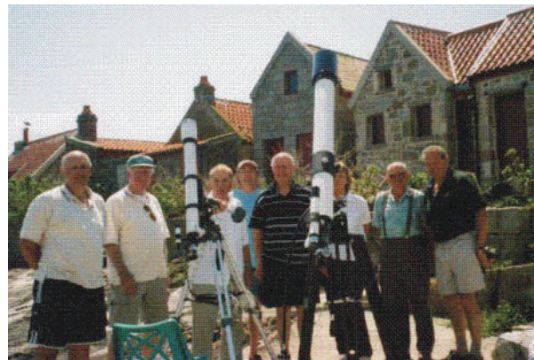
Above: Members attending the inaugural set-up Below: A view of the location